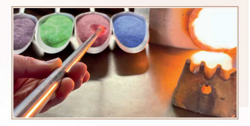
"The most wonderful jewellery I could ever wear." Client message - Facebook